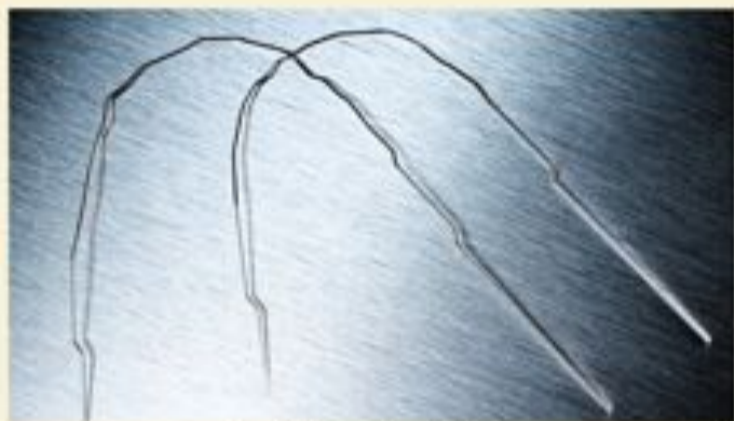
Shape Memory Alloy Archwires

Your wires are fabricated by computing the wire design needed to achieve treatment goals, and then sending the prescription to a robot. All of the bends your orthodontist requires are placed into one set of wires by the robot. Normally, this process would require adjustments over weeks or months when done by hand.